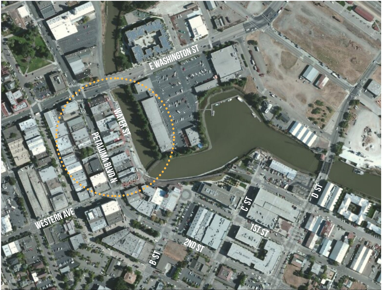
FOCUS AREA Waterfront Plaza Area - Petaluma, CA

site of Petaluma’s first trading post and is bordered by a mosaic of businesses that have secondary access to the river. This is a highly visible location in the public right-of-way and the project offers the opportunity for the artist’s work to be integrated into a key historic district along the City’s riverfront.