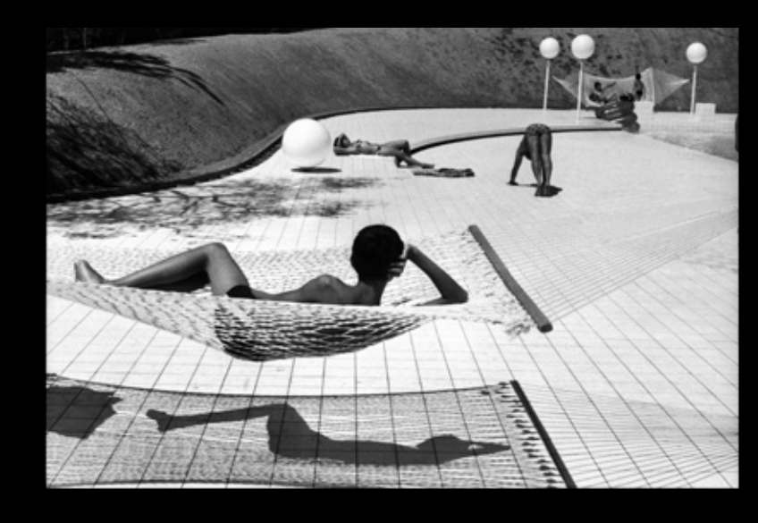
Martine Franck Pool designed by Alain Capeilleres. Town of Le Brusc. Provence. France. 1976.