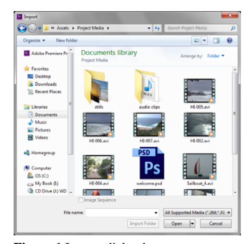
Figure 1 Import dialog box

Note: You can select a group of contiguous files by using the Shift-click method (click a clip and Shift-click the last clip in a group). If you want to select all but a few files, select a group and then Ctrl-click (Windows) or Command-click (Mac OS) individual clips to deselect them one at a time.