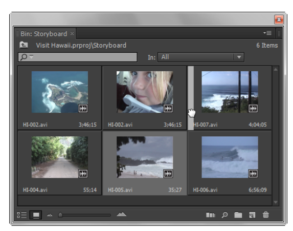
Figure 3 Storyboard bin thumbnail viewer

Note: For more information on trimming clips in the Project panel, refer to the guide, "How to manage media in the Project panel."