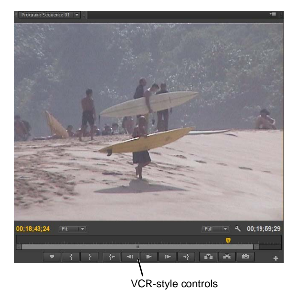
Figure 7 Program Monitor

View the sequence critically. Note if there are any jump cuts or awkward edits. Some clips will probably be too long. You can fix those flaws by using methods explained in the guides titled "How to work with clips in the Timeline panel" and "How to trim clips in the Timeline panel."