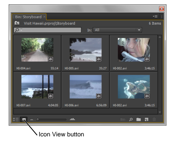
Figure 2 Storyboard bin in a floating panel

8. If it's not already selected, click the Icon View button to view thumbnails for each clip ( Figure 2 ).